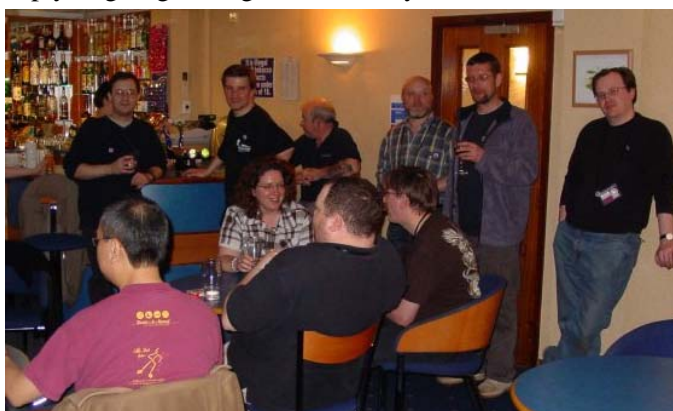
Good use was made of the 24 hour bar...

A small bar/eating area provides “continental” breakfast facilities; the bar is open 24 hours with two on-tap beers and a good range of bottled drinks (soft and alcoholic). The coffee machine is on continuously throughout the day and just like last year there will be free snacks from BITS to keep you going throughout each day!