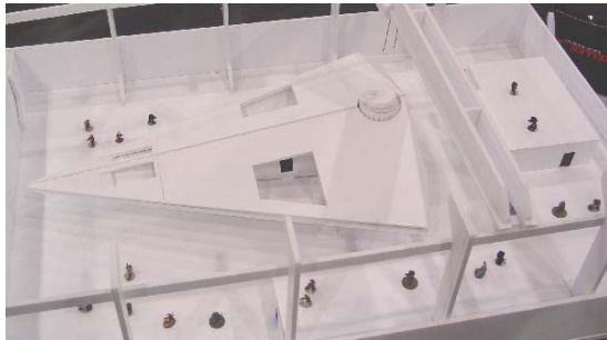
Miniatures skirmish around a berthed Scout ship

*Mongoose Traveller rules are preferred but you may run another canon rule system if you wish.