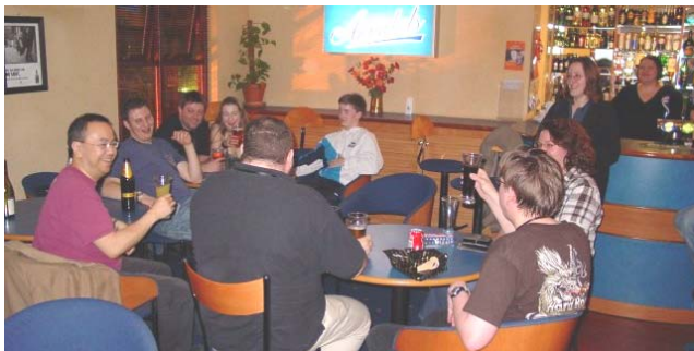
The 24 hour bar...

A small bar/eating area provides “continental” breakfast facilities; the bar is open 24 hours with two on-tap beers and a good range of bottled drinks (soft and alcoholic). The coffee machine is on continuously throughout the day and just like last year there will be free snacks from BITS to keep you going throughout each day!